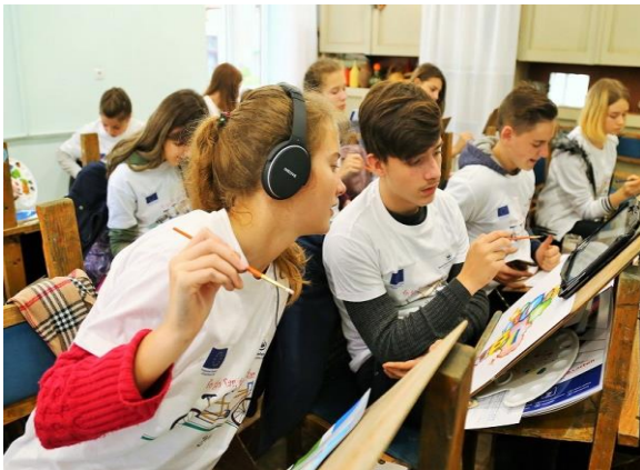
“Colour the border!”, Chernivtsi

More details and photos from the ECDay campaign, that involved 74 different cities in European Union and the neighbour countries, are available on the official website: https://www.ecday.eu/