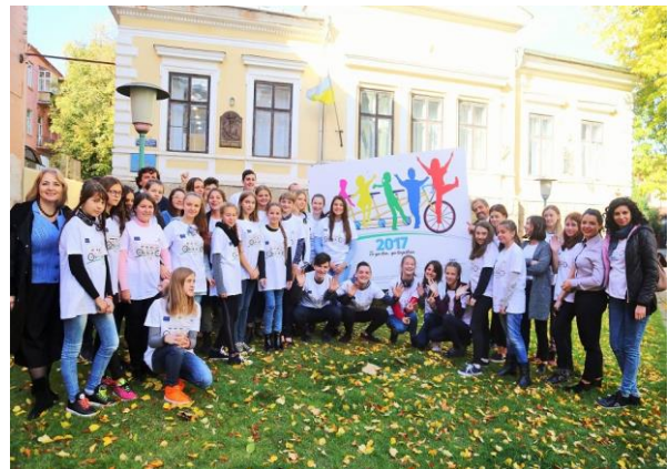
“Colour the border!”, Suceava